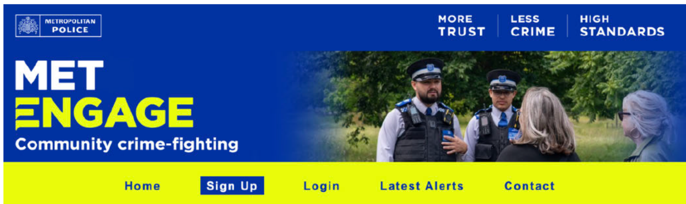
screenshot of Met Engage public postings 23/09/2025 posted at 11:51:50